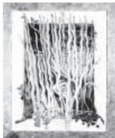
"Just One Kiss"