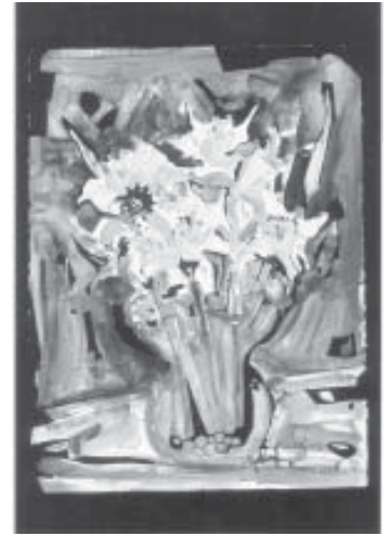
"The Turquoise Vase"