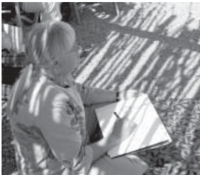
"The Turquoise Vase"