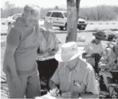
"The Turquoise Vase"